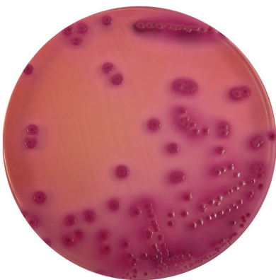
Escherichia coli ATCC 29522

Our reputation and success throughout the world are the result of a combination of uncompromising quality systems, technical expertise and innovative thinking.